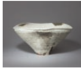
Kohiki bowl, 2009 stoneware diam. 34 cm (SHM127)