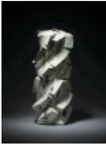
Kohiki tall twisted pot, 2009 stoneware height 34.5 cm (SHM137)