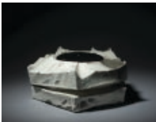
Kohiki mizusashi, 2009 stoneware, lacquer lid diam. 20 cm (SHM135)