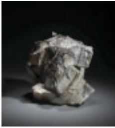
Shino triangle pot, 2009 stoneware height 22 cm (SHM144)