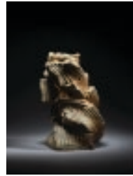
Natural-ash, twisted pot, 2009 anagama fired stoneware height 28 cm (SHM139)