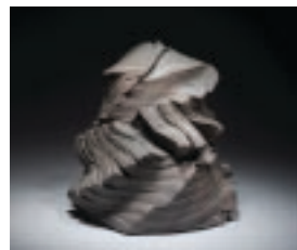
Tanka twisted pot, 2009 charcoal fired stoneware height 18 cm (SHM143)