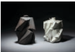
Kohiki twisted bottle, 2009 stoneware, height 12 cm (SHM136)