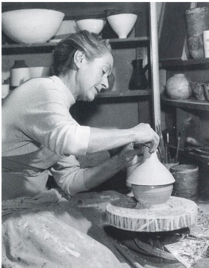
08: Lucie Rie